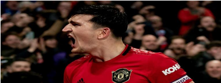
Harry Maguire Playing for United

HTTPS://WWW.SKYSPORTS.COM/FOOTBALL/NEWS/11667/11975052/HARRY-MAGUIRE-EXCLUSIVE-MANCHESTER-UNITED-WANT-THE-TITLE-NOT-JUST-A-CHAMPIONS-LEAGUE-SPOT