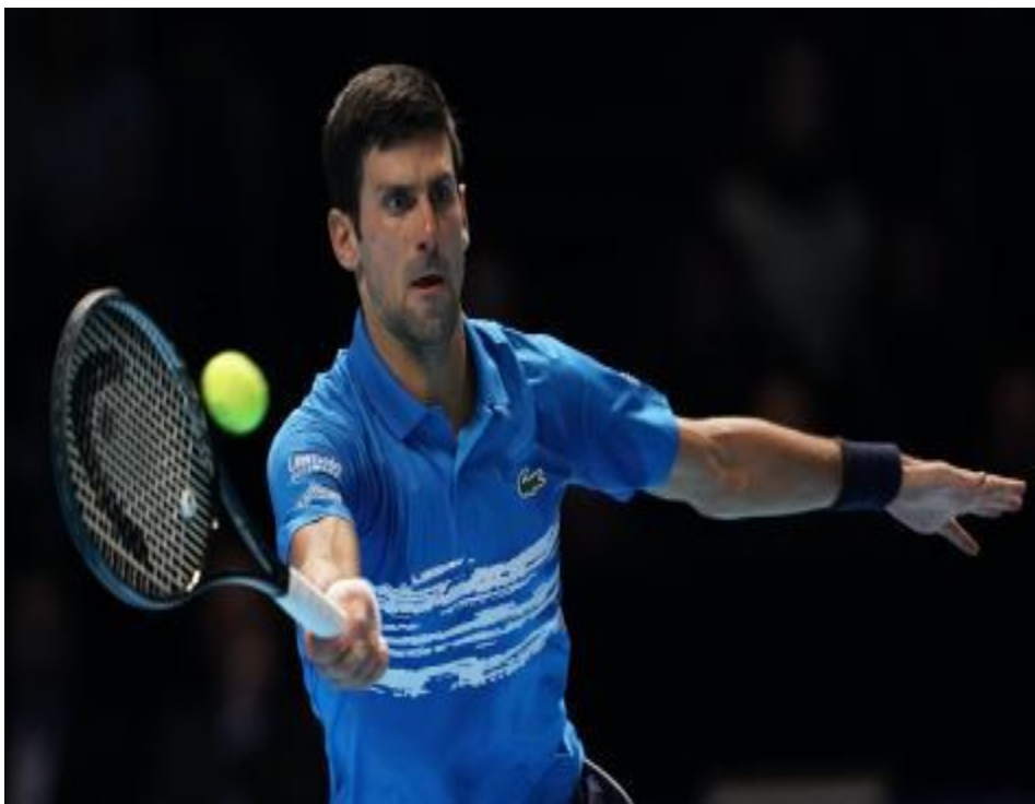
DJORKOVIC: Has concerns of vaccines

Manchester United have frozen season-ticket prices and while fans can renew now, the 1 May deadline that was initially in place has been suspended. "This will be continuously reviewed and a new deadline will be put in place once there is confirmation of the start date of the 20-21 season," the club said. If this season's remaining fixtures at Old Trafford are played behind closed doors season-ticket holders will get a pro-rata rebate against season tickets for next year, or a pro-rata cash refund based on the number of games still to be played.