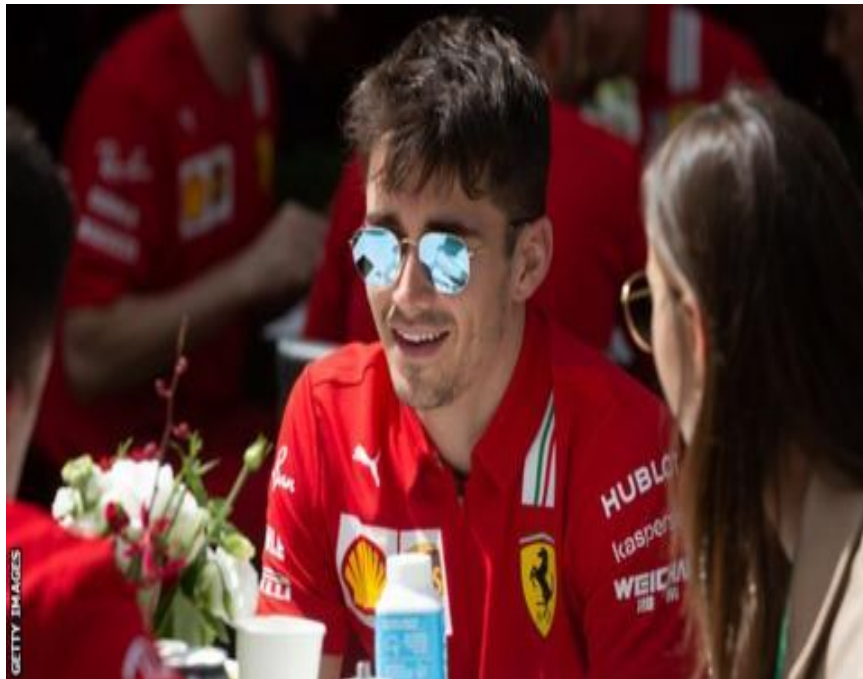
MOTOR SPORTS: Charles Leclerc pictured relaxing while away from racing before lock down.