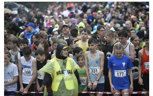
FUN RUN before the Great Eastern Run in 2019

as we know it will be disappointing for lots of people and also the many charities that benefit from the event. That said, it is the right decision, given the fact we do not know what the next six months will bring and how long the country will be asked to socially distance to limit the spread of the Coronavirus. In addition, an event such as the Perkins Great Eastern Run takes many months of planning which would be well underway by now. Many of the suppliers we use are also temporarily closed. We hope that all of our amazing runners, running clubs, businesses and residents will understand this decision and get behind the 2021 event to help the event bounce back and make it one of the biggest and best we have seen for many years."