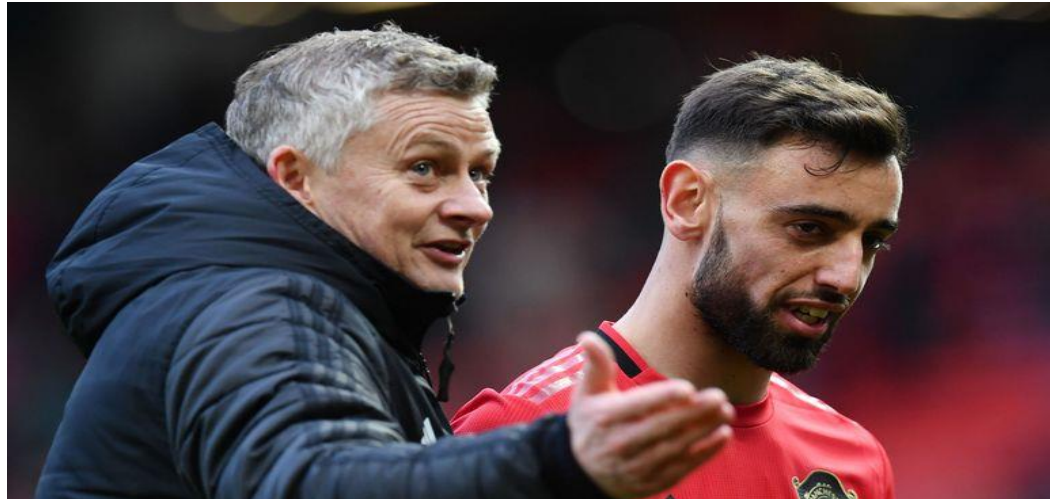
Ole Gunnar Solskjaer's side are fifth in the Premier League, three points off the top four

"We don't want to be challenging for this Champions League spot, we want to be challenging for titles" Harry Maguire