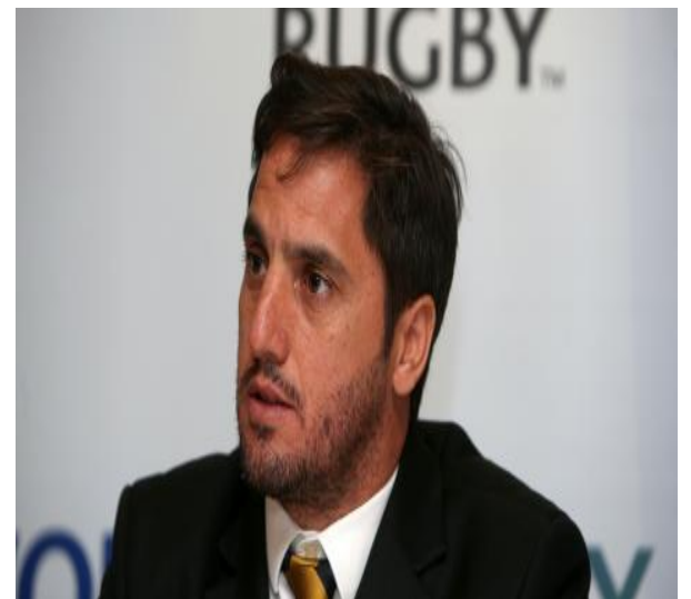
World Rugby chairman candidate Agustin Pichot would take the British and Irish Lions to a global stage if he is elected.

room for the Lions. It is a traditional thing but we can still add a modern look to it. I would use the Lions on a more worldwide scale. I would like to see that brand travel even further. They would be very popular in North and South America but that's a conversation to have with the CEO of the Lions." Pichot hopes to end Beaumont's four-year reign in the sport's top job, but has not received any feedback from the majority of the Six Nations unions. "I would like to talk to each individual union," added Pichot. "I sent a personal note to every country and I haven't had any replies from some of the CEOs. "I only received one email asking me about the future of the game from the Six Nations unions — that was Wales — and I think that's poor. Every CEO should be responsible for learning what is best for the game, even if they don't