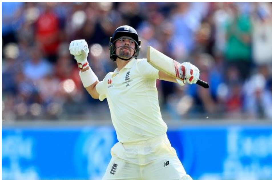
RORY BURNS: Concerned over his England place as opening batsman.

As long as everyone can stay safe and healthy it will be great to get back to playing tournament golf. To be able to play in the Masters, whether in November or April, doesn't matter to me - to go to Augusta on any day is always a special day for me. I hope we get to a stage where the tournaments start having crowds, to get back to some sort of normality, but I'll just be happy to get back playing golf. I miss just simple things like hitting a bucket of balls."