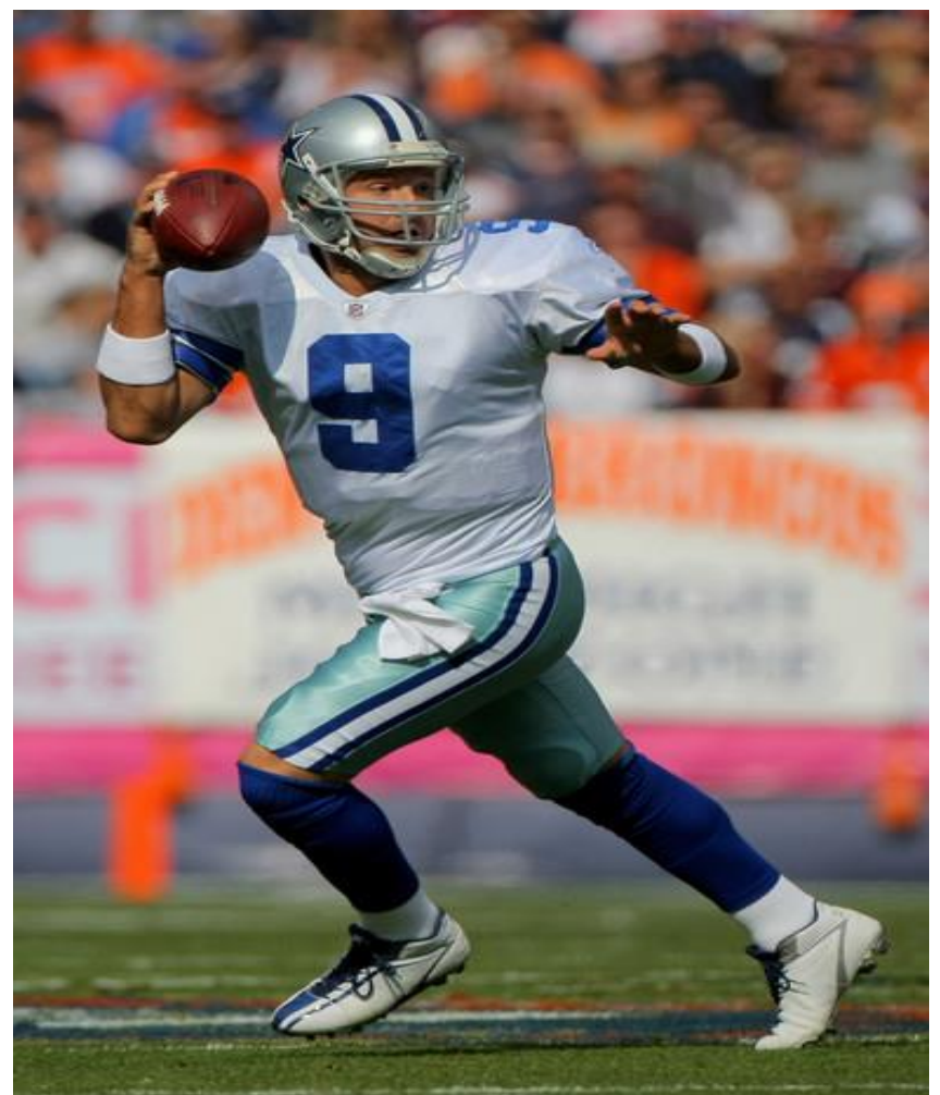
TONY ROMO- in action during his playing days for the Dallas Cowboys