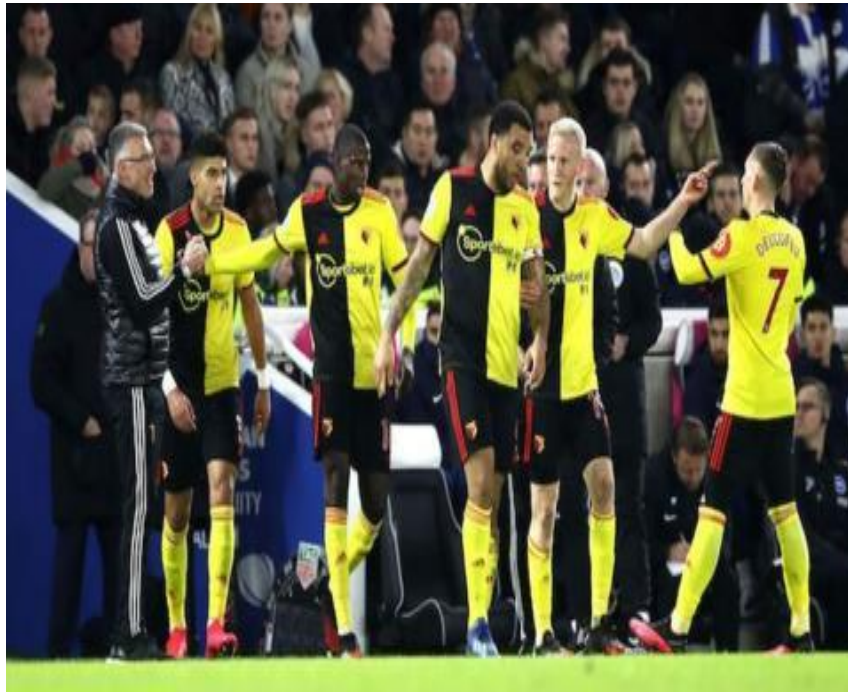
WATFORD: Seen celebrating a goal

Watford are set to become the third Premier League club to agree wage deferrals with their first team squad. Earlier this month, Southampton and West Ham confirmed their players would defer part of their salaries because of the coronavirus pandemic. Arsenal players are set to take a 12.5% pay cut while Chelsea's will reportedly agree to a 10% decrease in salary. In addition to the players, Watford's senior management and executives are also expected to agree to deferrals. Talks with the Watford squad have taken place amid a backdrop of discontent over the payment of last season's bonuses, with that issue not yet resolved to the players' satisfaction. However, the club are close to a wages deal, having told the players they are not intending to furlough staff. It comes after Premier League-wide talks aimed at a collective pay deal broke down without resolution. The Premier League proposed a 30% pay cut, but the Professional Footballers' Association said that would affect tax contributions to the NHS. Earlier this month, Premier League players launched the #PlayersTogether scheme to generate and distribute funds to the NHS.