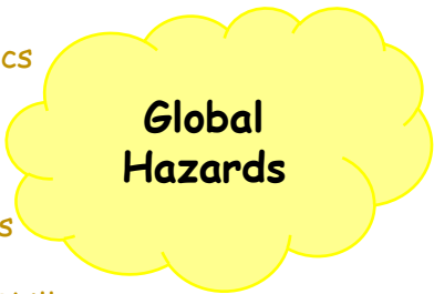
Plate Tectonics Earthquake Volcano Earths Structure Plate Boundaries Natural Hazards Tsunami Decision Making Skills