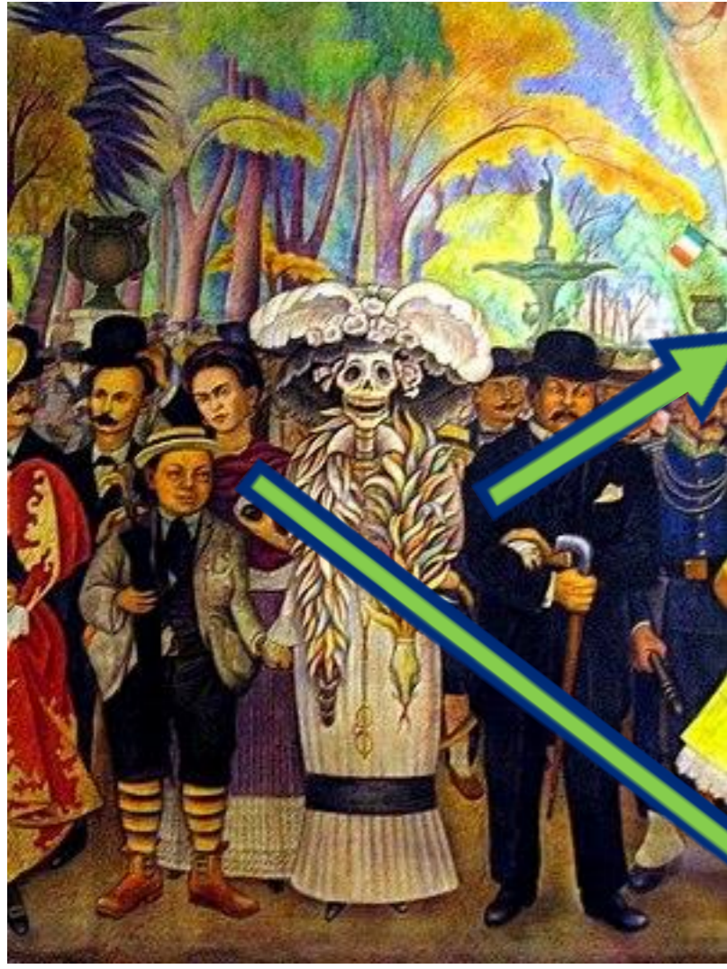
Sueño de una tarde dominical en la Alameda Central or Dream of a Sunday Afternoon in the Alameda Central is a mural created by Diego Rivera. It was painted between the years 1946 and 1947. La Catrina is one of the figures included in the mural.